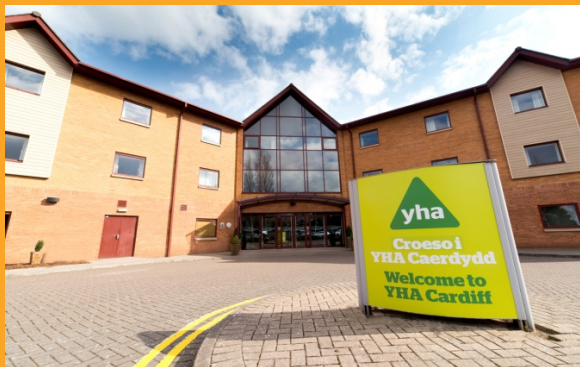
YHA Cardiff Central

YHA Cardiff Central is a modern youth hostel located in the heart of the city centre. This new centre is within walking distance of all the best attractions in Cardiff; the Millennium Stadium, Cardiff Castle, Cardiff Bay and the fantastic St. David's shopping centre. It is ideal for group short stays.